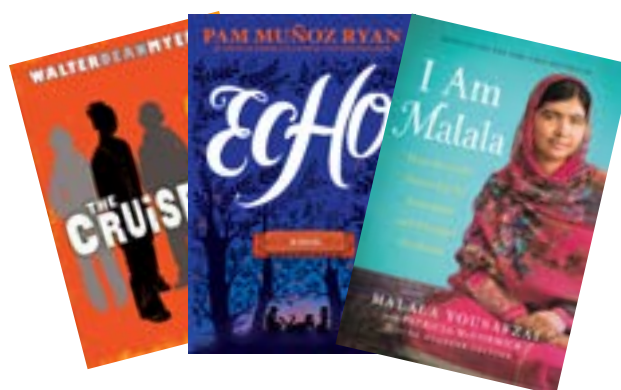
INDEPENDENT READING LIBRARY